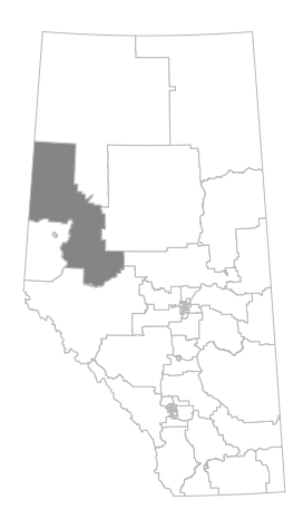
CENTRAL PEACE-NOTLEY, ALBERTA

Northern Lakes College's activities in Central Peace-Notley (NLC Central Peace-Notley) creates a significant positive impact on the business community and generates a return on investment to its major stakeholder groups—students, taxpayers, and society. Using a two-pronged approach that involves an economic impact analysis and an investment analysis, this study calculates the benefits received by each of these groups. Results of the analysis reflect fiscal year (FY) 2021-22.*